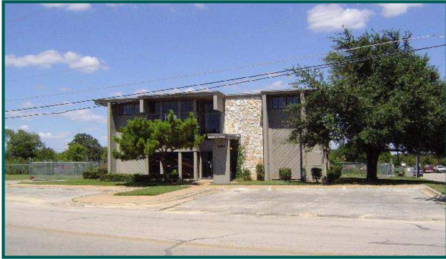
1603 Northwest Boulevard